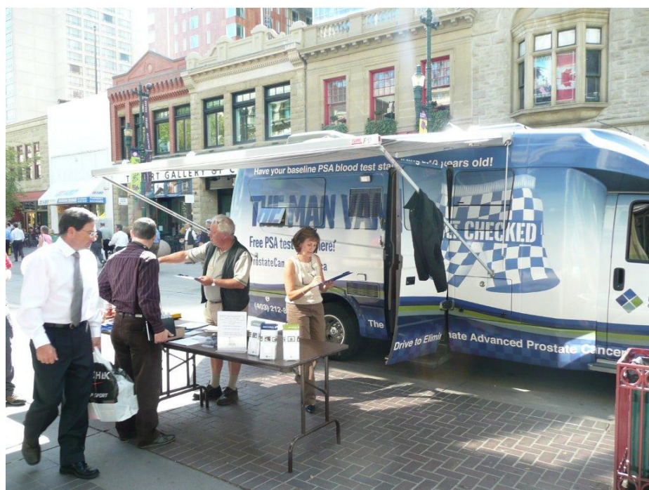
Man Van™ on Stephen Avenue Mall

The Man Van™ is the first and only mobile PSA testing unit in Canada and has been on the streets of Calgary since June 2009. The Centre uses the Man Van™ to help further our mission of eliminating advanced prostate cancer through increased awareness about the early detection of prostate cancer. On average, the Man Van™ tests 2000 men a year, saving countless lives.