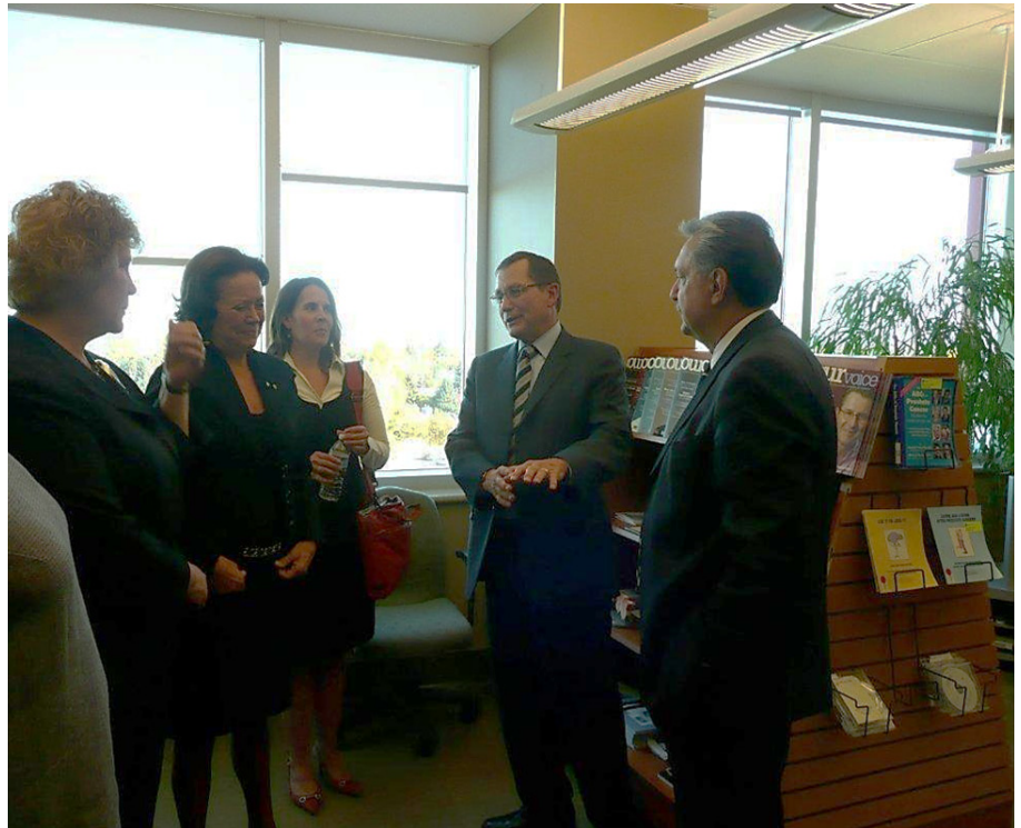
Premier Ed Stelmach at Grand Opening